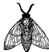
Figure 2: A sample black and white graphic (.pdf format) that has been resized.